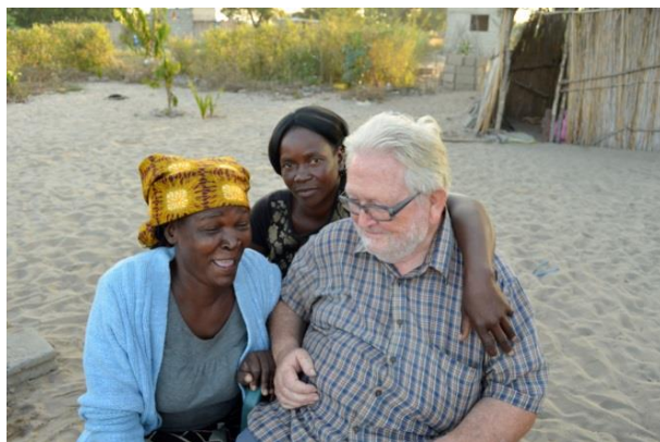
"for a lot of people he is like a father"