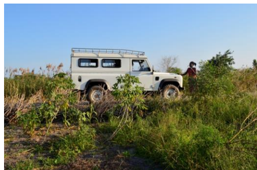
"on its way to the fields"